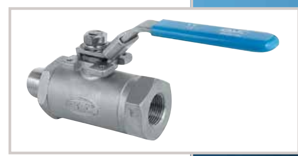
**NACE MR-01-75 Certified**