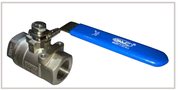
**NACE MR-01-75 Certified**

Construction: Two piece seal welded body, full bore, free floating