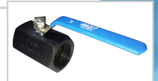
**NACE MR-01-75 Certified**