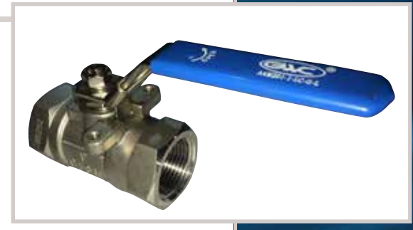
**NACE MR-01-75 Certified**