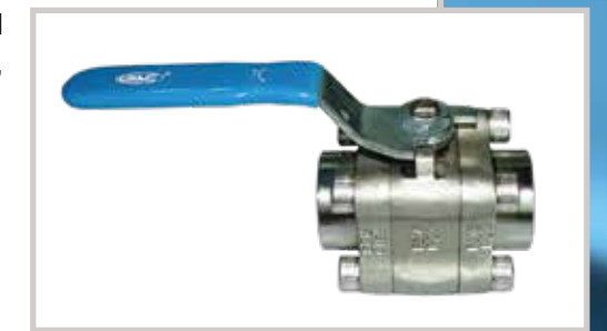
**NACE MR-01-75 Certified**