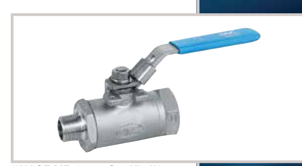
**NACE MR-01-75 Certified**